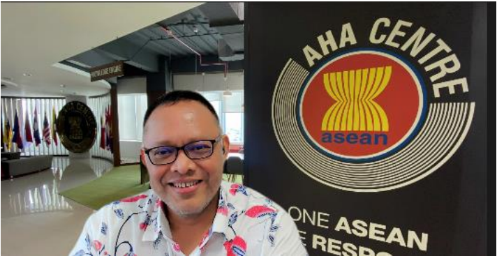
Figure 2. Deputy Executive Director interviewed by LACER

Moreover, it may be used for assessing and comparing disaster management capabilities of ASEAN Member States. Such an overview would enable the AHA Centre to guide the Member States toward developing specific disaster management abilities. This would not only benefit members but allow the AHA Centre to play a pivotal role as a mediator of cross-border collaboration and peer-to-peer learning, while strengthening disaster management capabilities across the region. Publication is expected shortly.