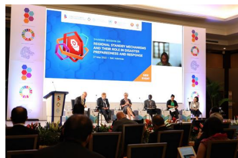
LACER at the GPDRR 2022

https://www.lacerproject.eu/sv/news/global-platform-for-disaster-risk-reduction/