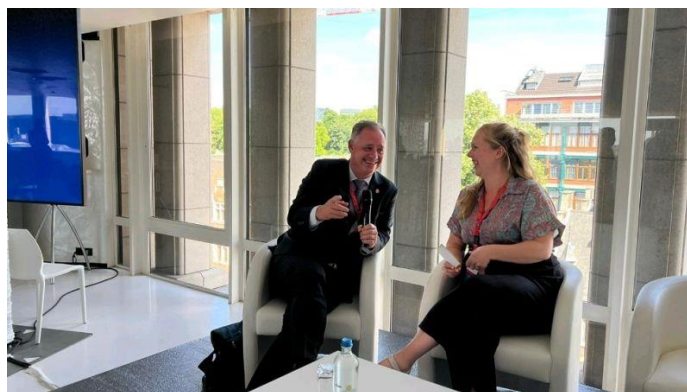
Figure 2: LACER team at panel discussion